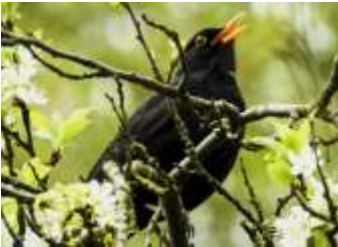
Blackbird singing in hedgerow

I was born in urban Lancashire – just about as remote as it could be from the reassuring and heart-lifting rhythms of the natural world. So, just as soon as possible, I sought to escape from industry and machinery and streets of endless houses and have consciously tried to learn as much as I can about the beauty, diversity and small (and big) miracles of nature. I am no scientist, but what follows are my personal observations and reflections – my own very personal nature notes.