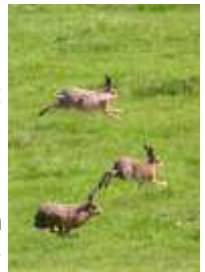
Hares having fun

The first time I saw a hare, I couldn't quite work out what I was looking at. There were several, 'boxing' and leaping around each other in a mad, irresistible dance. So unusual were they, that they led me to try to find out as much as I could about them; and to