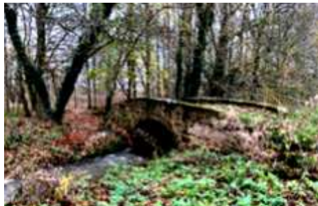
Packhorse bridge, Headlam village

Her son had met someone of similar age to him, a young Frenchman, who had been sent by his family to China to open up a business and to gain some experience, before he became ready to inherit the family business back home. This project had not been successful.