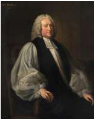
Archbishop Matthew Hutton

The February edition of this Magazine told the story of the first Marske Archbishop – Archbishop Matthew Hutton, who supported Elizabeth I; accumulated enough wealth to buy the Marske Estate; moderated his attitude to papists over time; and died in 1606 as Archbishop of York*.