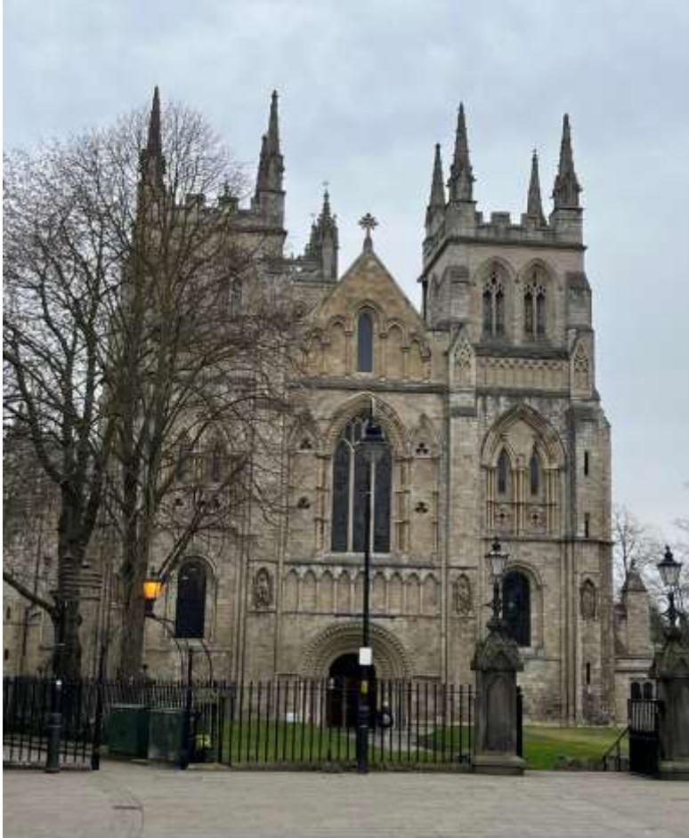
Selby Abbey — West façade