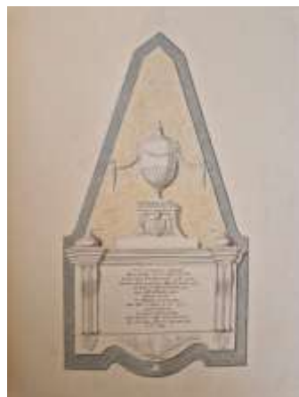
(Right) 18th Century Designer’s drawing of Matthew Hutton Memorial

(* ) The eagle-eyed amongst you may also have spotted that the reference in the previous article to Marrick Priory was incorrect. The nuns there were all of the Benedictine order — not Augustinian).