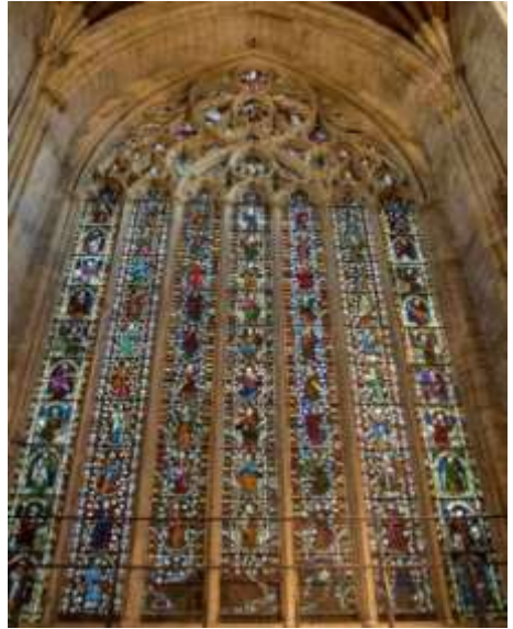
The Jesse window