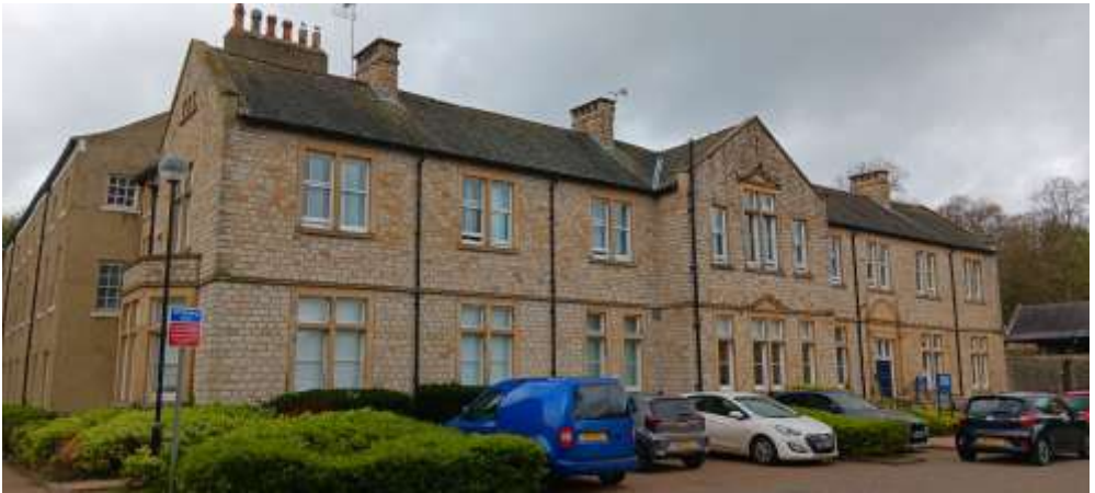
The Friary Boarding House — now the Friary Community Hospital

boarding pupils from outside the town, who were not eligible for free Grammar School places. Other additions were a gymnasium, which later became the woodwork room and which currently serves as the present hospital's physiotherapy department, and the Playing Field which eventually became the supermarket and large car park, after a great deal of local controversy.