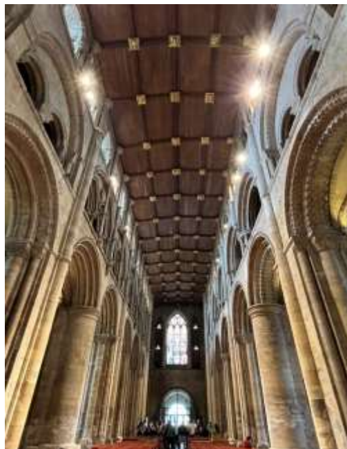
The central nave looking towards the west door