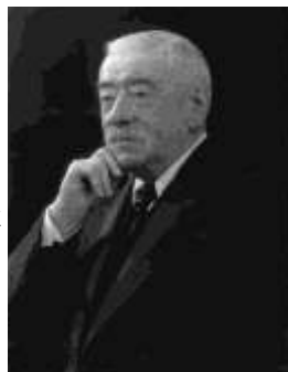
Lawrence Dundas 1844-1929 Marquess of Zetland