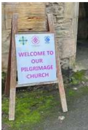
Sign outside Gainford Church