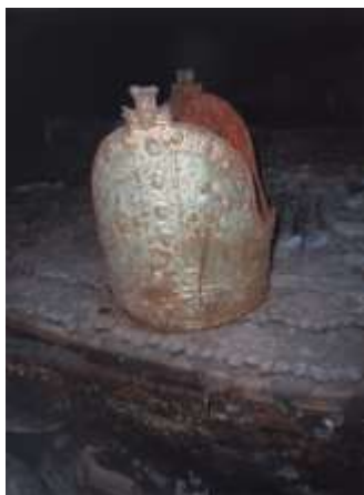
(Left) Funerary Mitre in vaults in Lambeth