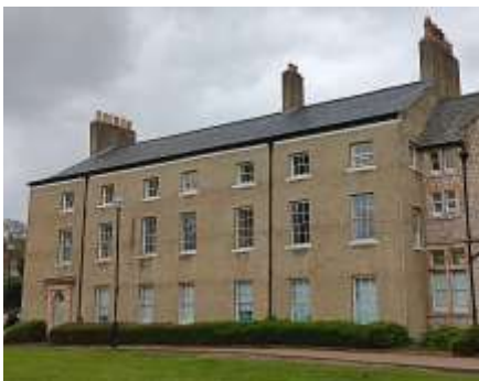
Headmaster's house — The Friary

He gave much of the rest of his estate to Richmond Grammar School, which had been situated in Station Road opposite St Mary's Church since 1850. The Friary itself became the residence of the school's headmaster. A large boarding house, 10 bays long, was added in 1901, and that is now the Friary Hospital. Having a purpose-built boarding house removed the need for headmasters to own a house large enough to accommodate