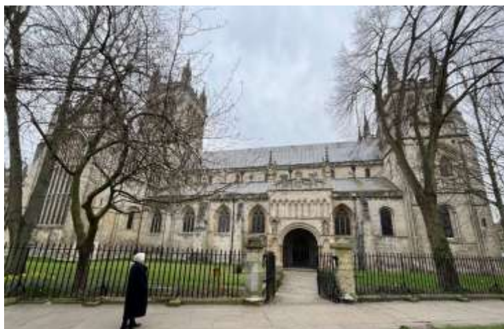
... and from the North

Selby Abbey was founded by Germain, a French nobleman and soldier, who was born about 378AD; became a Christian; and was nominated Bishop of Auxerre in NW France 30 years later. Auxerre is a lovely medieval town in Burgundy and, being a Francophile and having visited Auxerre in 2018, I was interested in its connection with Selby. It is believed that Germain visited England twice during his lifetime.