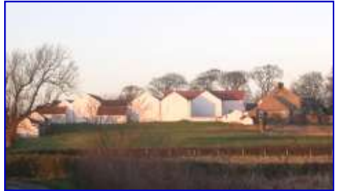
White painted buildings in Langton

Joining a farm track and turning left, we passed between a series of old, but well-maintained, cottages, almost all painted white. Legend has it that this resulted from an instruction from Lord Barnard. In days of yore, his Factor was caught in a violent storm one dark evening whilst out collecting rent. He was able to locate a place of shelter quite easily in a tenant's farmhouse, because it happened to be painted white. So the land-owning lord insisted that all buildings on his land should be painted white.