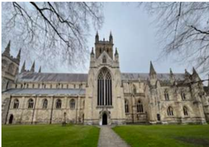
Selby Abbey — from the South

Unlike some of the other cathedrals I have visited in recent years, Selby Abbey is surrounded by space which creates an impression of vastness. If you stand in the gardens opposite the south entrance, you cannot fail to be awed by its majesty.