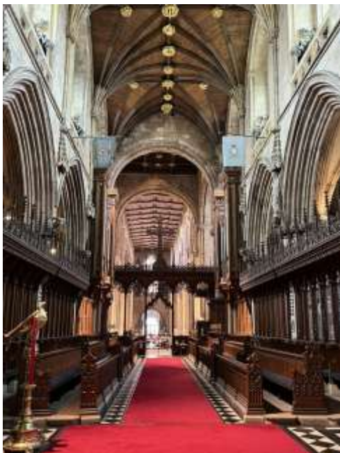
The Choir with its vaulted ceiling

The pillars in the nave support arches, many with a zig-zag pattern. The nave was