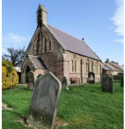
St John the Evangelist Church, Ingleton

The rain had now completely stopped and the low November mist which had settled on the fields was beginning to lift. The anticipated 'clarty' paths hardly ever in evidence, despite significant rainfall, as we saw our now familiar Camino waymark just down from the parish church in Ingleton. Keeping the well-established hedgerow on our right, as instructed by the excellent guidance notes, we had progressed no more than a field's length when we were semi-adopted by a bounding grey hound, which turned and joined us on our way, before turning back towards its owner and friend, with another less bouncy brown hound of the same breed i.e. a dog.