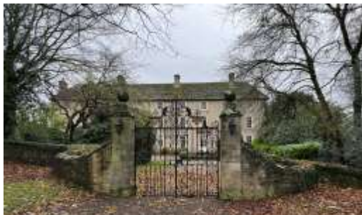
Headlam Hall — now a hotel

With this family tragedy much in mind, we bade our farewells and continued southwards, past the gates of Headlam Hall Hotel and then bearing right on a path towards our eventual destination of Gainford, where two more chance encounters took place. The first was with a couple who were on a weekend break in the area. They are frequent visitors